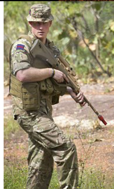
Prince Harry at Crocodile River

poachers. The Parabats should be assigned to hunt down poachers in the game reserves. The Reconnaissance Commando should be tasked to track down and deal with the organised crime syndicates behind the poachers. As with piracy, history proves that, when dealing with violent and ruthless criminals, only the most decisive and sustained action can prevail. Bounties can be placed on the heads of poachers and crime syndicates behind this, to provide incentives for independent contractors to track them down.