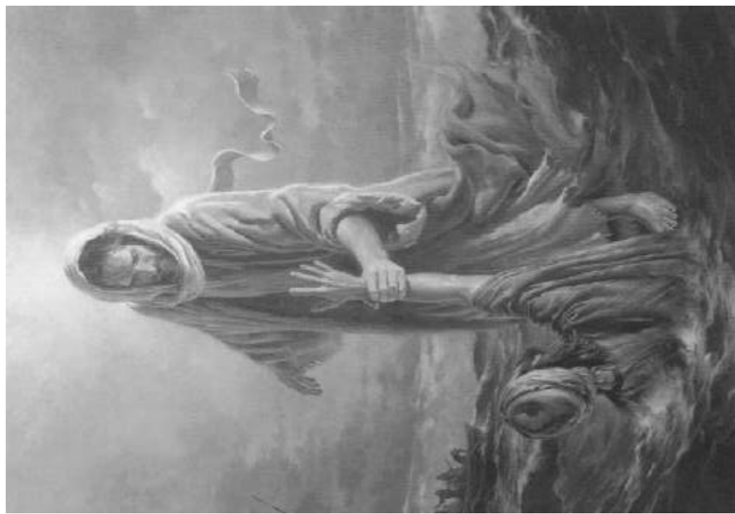
Jesus Christ is the greatest Man who ever lived, and the Bible is the greatest Book ever written.