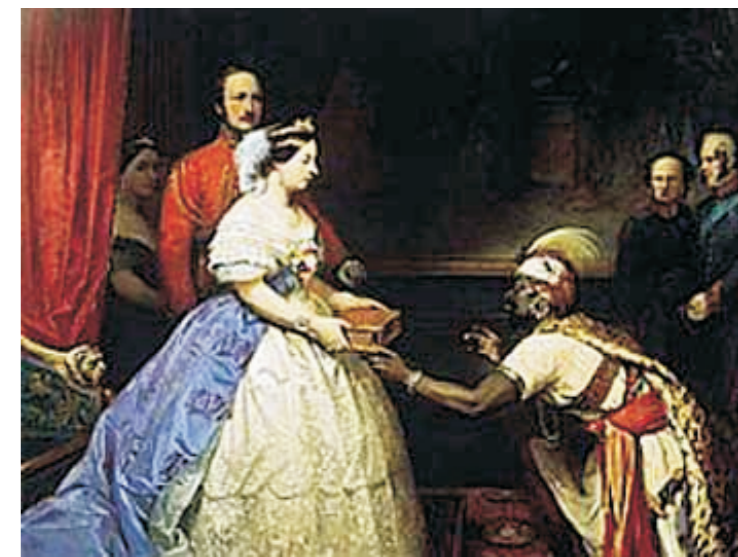
Queen Victoria answered a visting African prince's question on what was the secret of England's greatness by presenting him with a Bible.