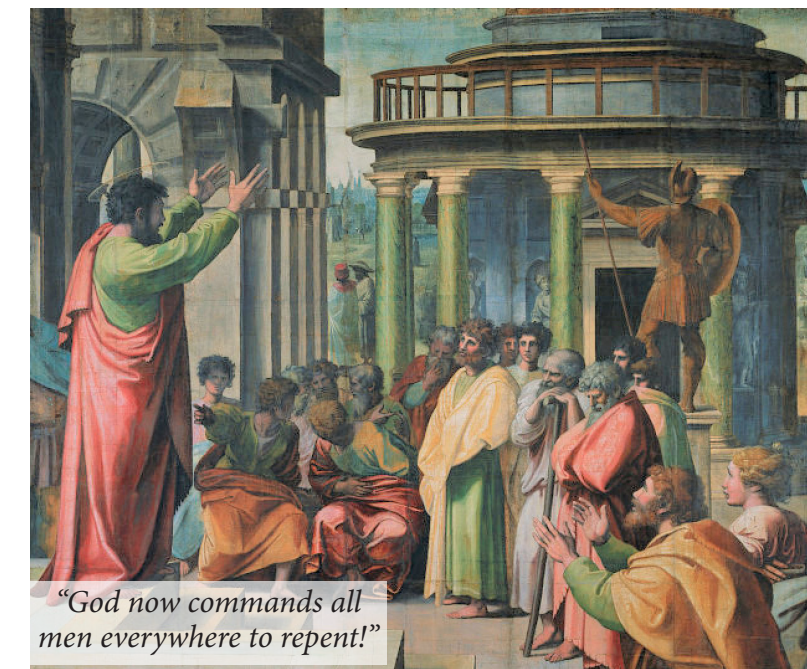
“God now commands all men everywhere to repent!”

Our Lord had singled out the first commandment “ You shall have no other gods before Me ” and the last “ You shall not covet ” The rich young ruler had apparently made an idol of his wealth. His riches had become more important to him than obedience to God.