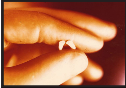
Pre-born baby's feet at 10 weeks

The Bible teaches us that GOD IS THE SOURCE OF ALL LIFE.