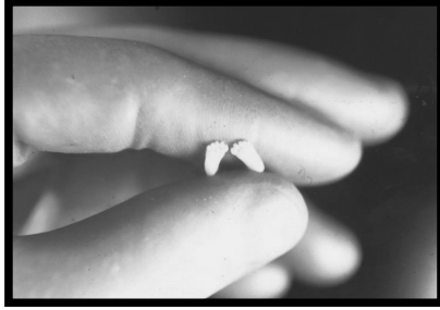
Pre-born baby's feet at 10 weeks

The Bible teaches us that GOD IS THE SOURCE OF ALL LIFE.